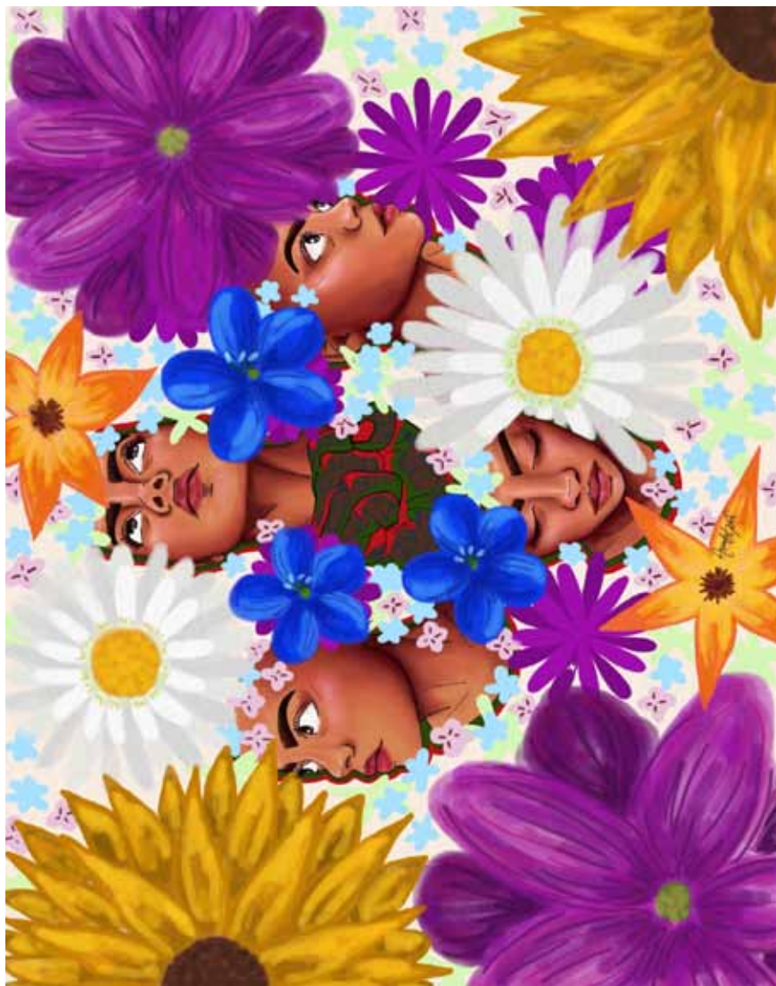
Self portait: with powerful flowers by Assata Goff