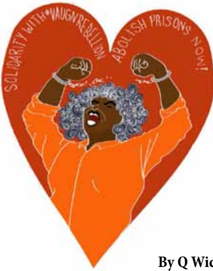
By Q Wideman