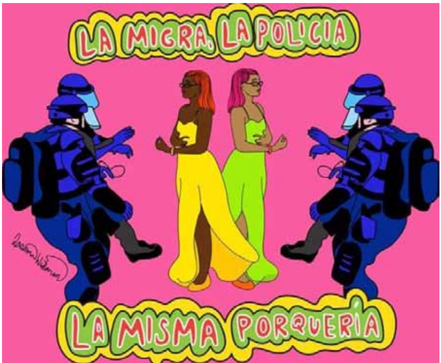
By Q Wideman